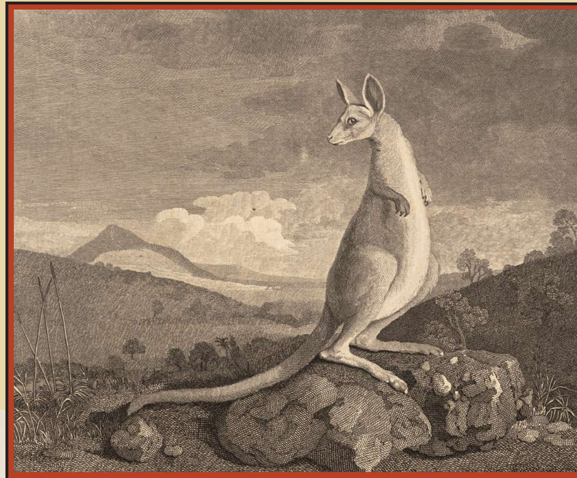
Left: Kangaroo, from John Hawkesworth, An account of the voyages... [of Capt. Cook], 1773.