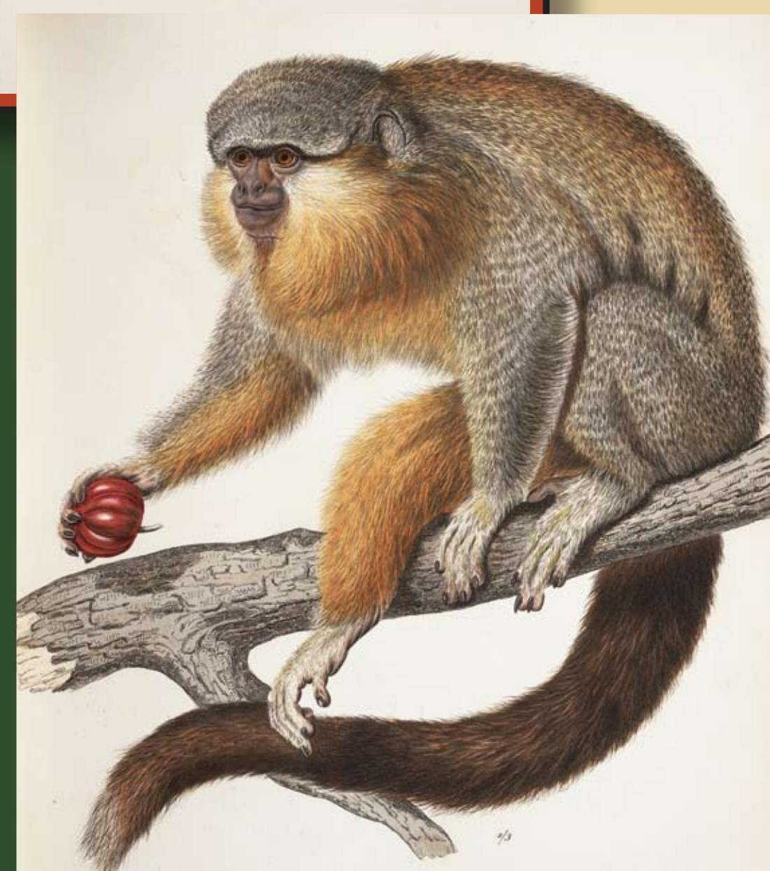
Top Right: Lar Gibbon, drawn by Werner, from Archives du Muséum d'Histoire Naturelle, vol. 2, 1841.