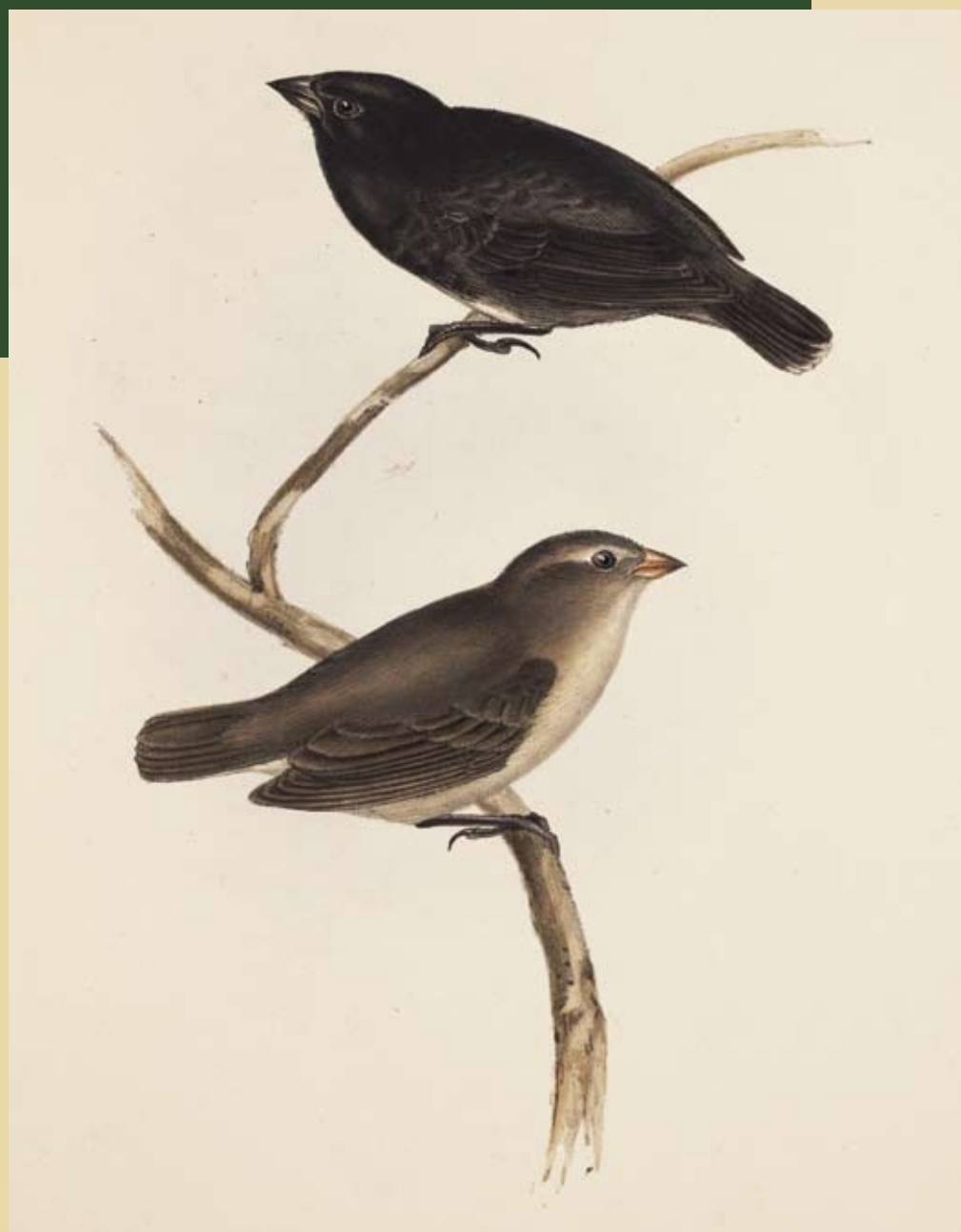
Near Right: Small ground finch, by Elizabeth Gould, from Charles Darwin, Zoology of the Voyage of H.M.S. Beagle, Part III: Birds, 1841.