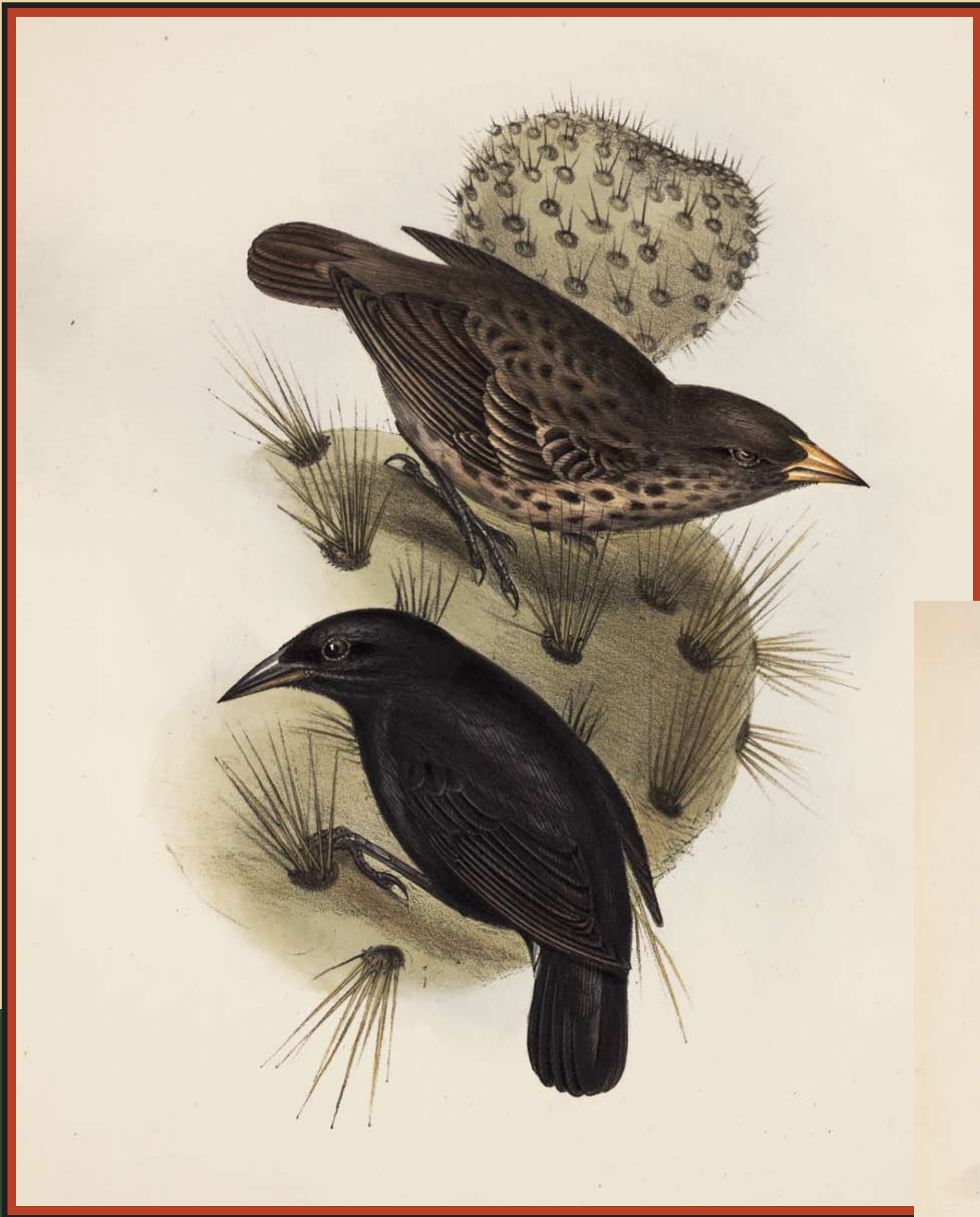
Above: Cactus finch, by Elizabeth Gould, from Charles Darwin, Zoology of the Voyage of H.M.S. Beagle, Part III: Birds, 1841.